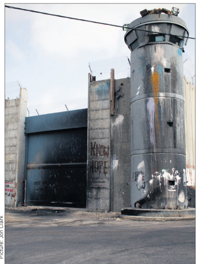
Palestinian wall - 'In its worst forms, Christian Zionism uses the Bible to justify racial superiority, population transfer and the dehumanisation of Arabs'

Zion's Christian Soldiers is published by IVP, price £7.99; ISBN: 9781844742141