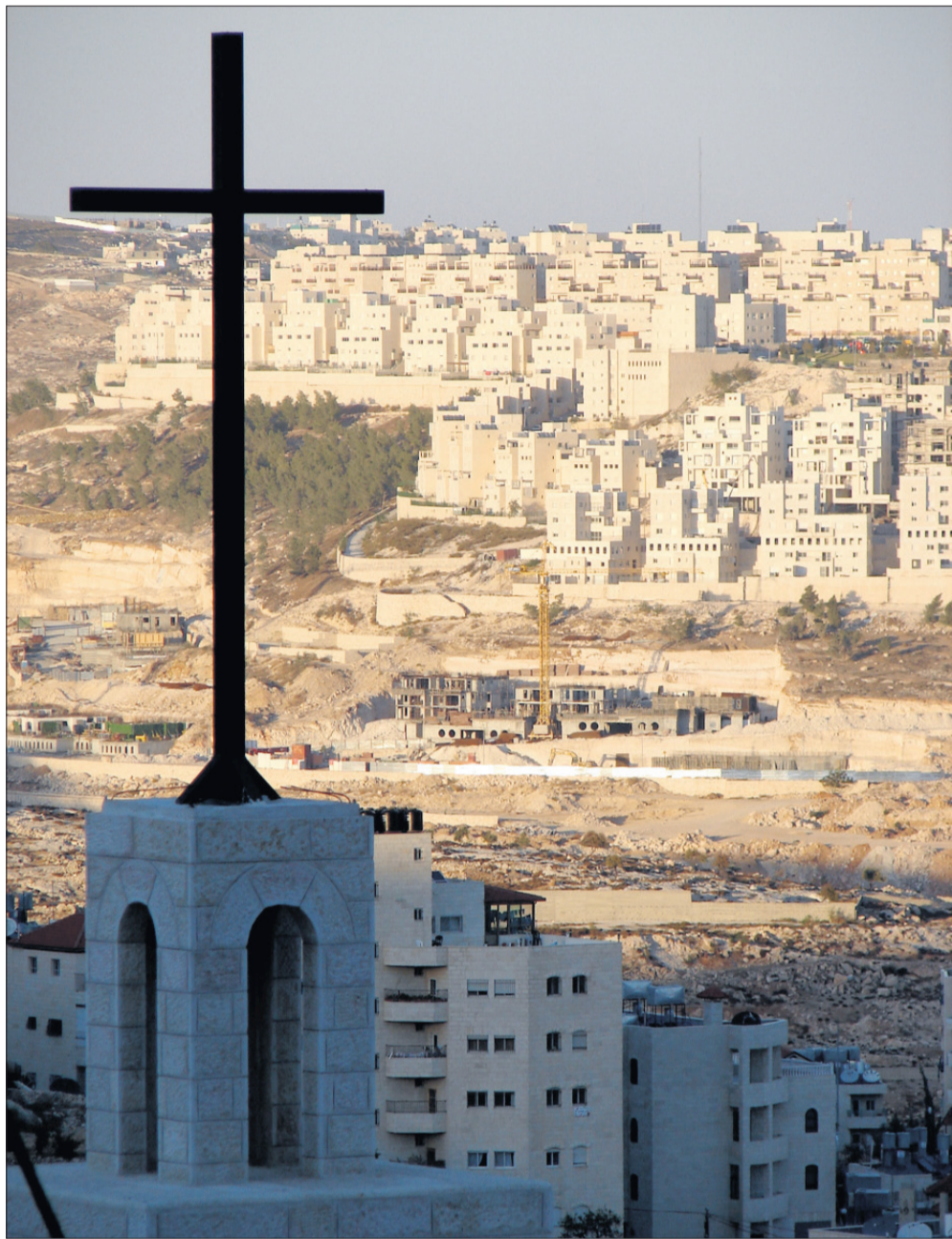
Land expropriation - A church looks out over a new Israeli settlement